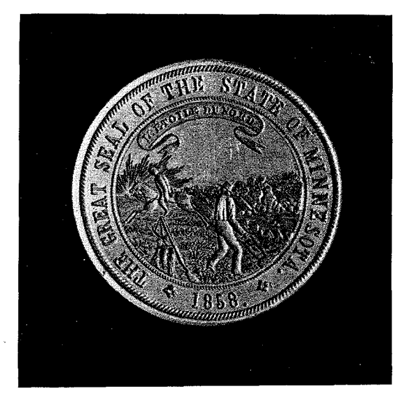
THE original die of the great seal, actual size