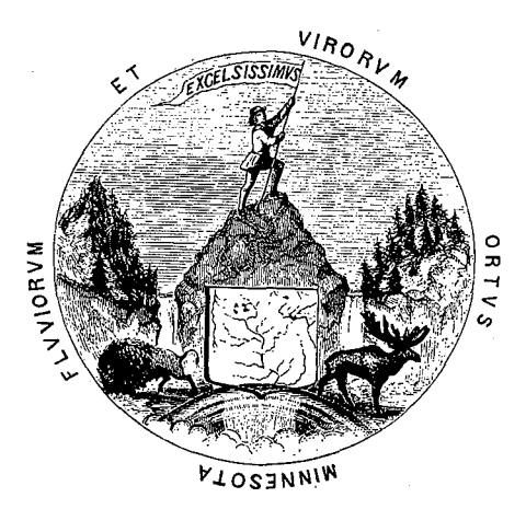
NEILL's design for a state seal

The story of its subsequent adventures can be traced in a series of letters recently discovered in the state archives and in the