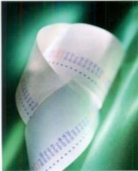
Audited Governmental Activities for the Year Ended June 30, 2006