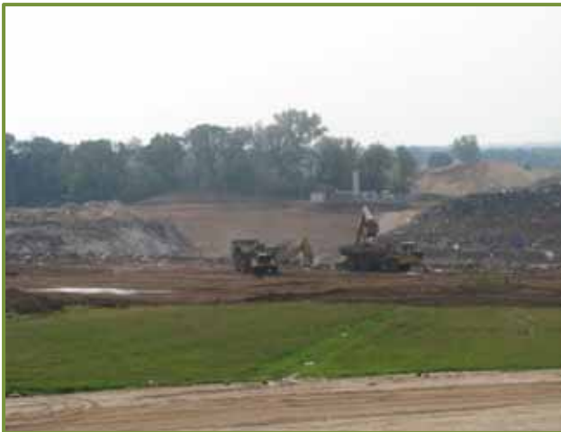
Waste cell construction at Washington County Landfill

Under the LCA, insurance carriers may request that the state's claims for natural resource damages (NRD) at any of the landfills in the CLP be included in settlements with the state. NRD payments received in FY 2009 as a result of settlements amounted to $424,604. Total NRD payments received through June 30, 2009 equal $8,655,282. NRD recoveries are used by the Minnesota Department of Natural Resources (DNR) to rehabilitate, restore or acquire natural resources to remedy injuries or losses to natural resources resulting from a release of a hazardous substance through the DNR's Remediation Fund Grants Program. No projects were awarded grant funds by the DNR in FY 2009.