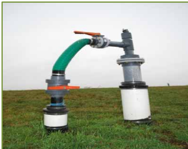
Gas well at Woodlake Landfill, Hennepin County

The costs shown are for invoices paid and dollars encumbered in FY 2009, not necessarily total project costs.