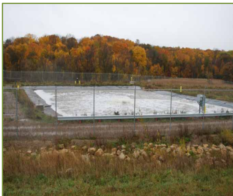
Aeration Lagoon at Woodlake Landfill, Hennepin County

In FY 2010, the CLP will implement remedial response actions based on its new site priority ranking system and to repair or upgrade existing remedial and monitoring systems. However, this work will depend on available funding. Projects that began previous to using the new priority system will continue to be worked on in FY 2010 even if they currently rank lower than other sites. Table 5 lists the anticipated response actions at specific landfills, assuming funding is available. Additional activities for FY 2010 include ongoing water/whole-house filter services to residents near the Washington County, Becker County, and Mille Lacs County landfills.