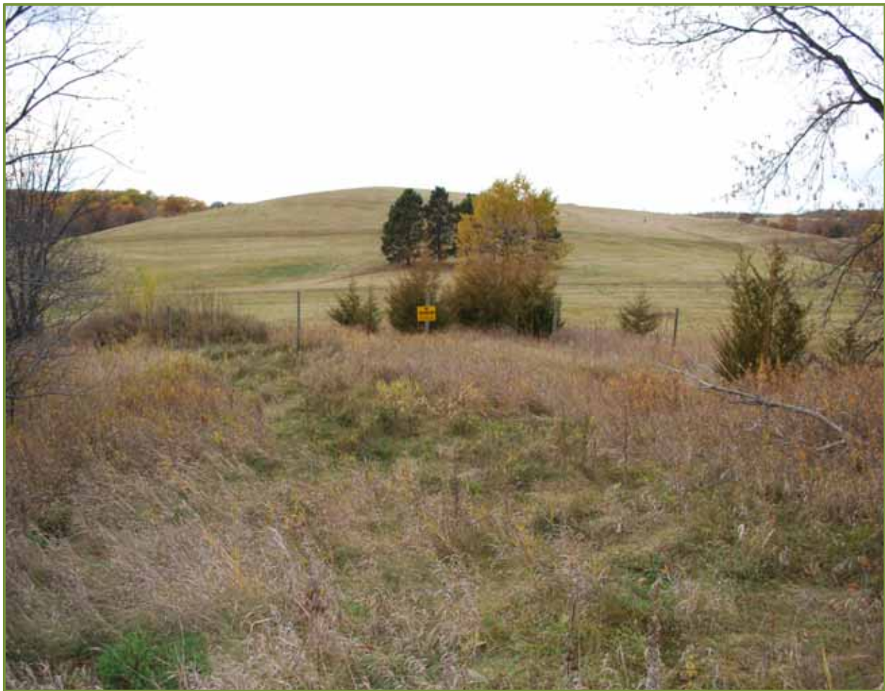
Panoramic of Lindala Landfill, Wright County