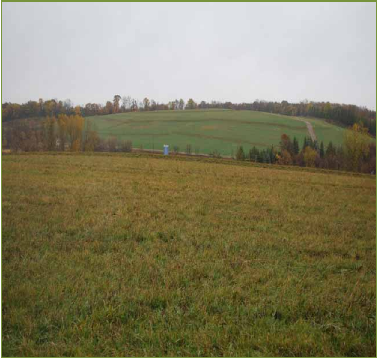
Panoramic of waste cell at Woodlake Landfill, Hennepin County