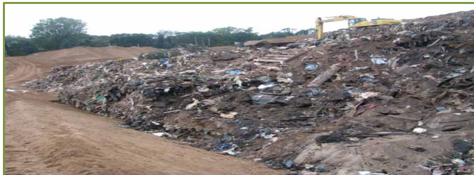
Moving waste at Washington County Landfill

The MPCA executed a Settlement Agreement and Consent Order with the 3M Company in May 2007 that authorizes 3M to take response actions to address releases of PFCs at three disposal sites. As part of this agreement, 3M has agreed to provide the MPCA eight million dollars for the MPCA's remedial actions at the Washington County Landfill. Through FY 2009, 3M has provided the MPCA five million dollars and, of this, $4.2 million has been spent. 3M provided the additional three million dollars in August 2009.