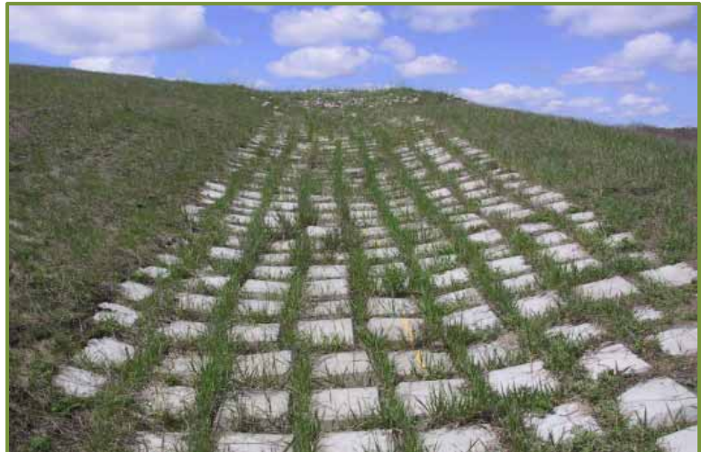
Cable concrete channel at Wadena County Landfill

In 1994, the Minnesota Legislature authorized $90 million in general obligation bonds to be appropriated over ten years. This money was to be used for construction of remedial systems at publicly owned, closed landfills. However, in 2000, Minn. Stat. § 16A.642 cancelled all unused bonds more than four years old, regardless of program need or original legislative intent. This resulted in the cancellation of approximately $56 million of bonding authority. Since 2001, however, the legislature has authorized $51.15 million of general obligation bonds for construction. There are 93 closed landfills that are publicly owned and eligible for bonds. Through FY 2009, more than $80 million of general obligation bonds has been spent on construction activities at 51 sites.