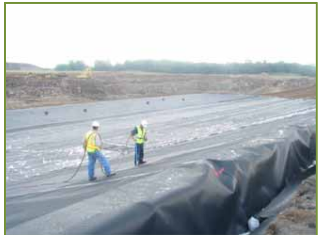
Testing for liner leaks at Washington County Landfill