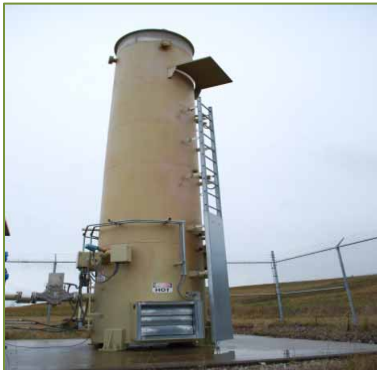
Gas Flare at Lindenfelser Landfill, Wright County

In FY 2009, 26 million pounds of methane were destroyed by the gas-extraction and gas-to-energy systems that are operated at CLP landfills (see Table 4). Since 2000, these systems have prevented about 237 million pounds of methane (2.26 metric tons of CO 2 equivalents) from entering the atmosphere. Stack test results from earlier studies show nearly 99 percent destruction of methane and other contaminants in the CLP's enclosed flares.