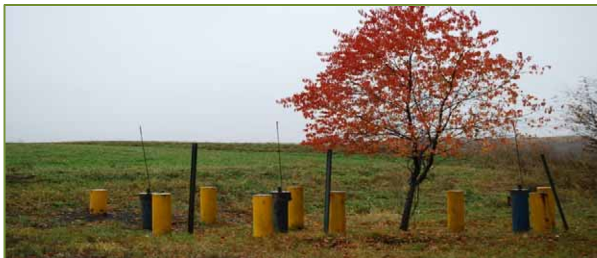
Groundwater monitoring wells at Woodlake Landfill, Hennepin County

The LCA also requires the CLP to reimburse eligible parties for past cleanup costs after completing corrective actions. Reimbursements to landfill owners, operators and responsible parties total $37,107,759, while reimbursements to the U.S. Environmental Protection Agency (EPA) amount to $4,014,550. The Freeway Landfill is the only site that remains eligible for reimbursement to the EPA, at a cost of $17,000, when it enters the Program.