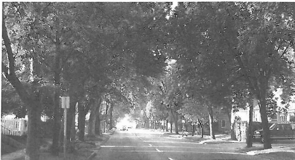
Typical Minnesota street covered in a canopy of ash trees.

Detailed information for Minnesota communities to make informed decisions about their community forests.