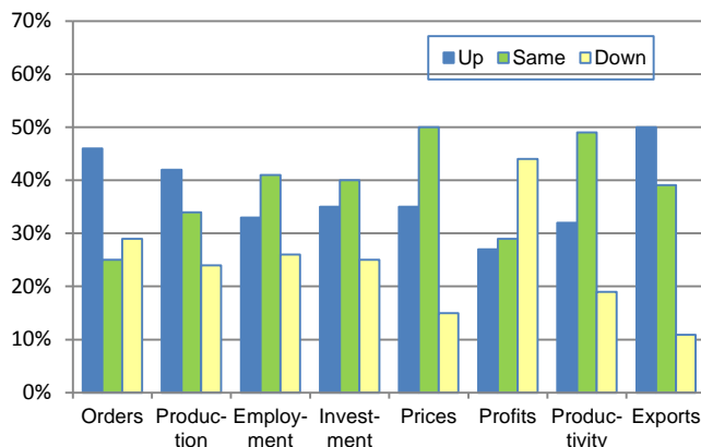
Outlook on Economic Performance for Minnesota's Manufacturing Industry -- 2012, Compared to 2011

Most Minnesota manufacturers experienced improved or unchanged conditions in 2012, compared with 2011. Half of respondents indicated unchanged prices, while 46 percent reported an increase in the number of orders. Nearly half of participants with foreign operations reported unchanged exports, and 47 percent reported the same production levels. However, 44 percent of all respondents indicated a decrease in profits.