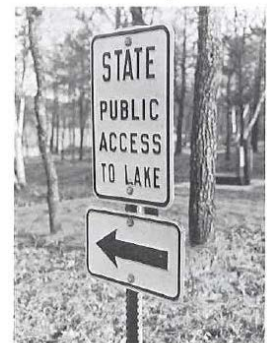
40 years to get to the lake?

The Commissioner was given the authority to mark the routes and work with agencies and private owners to secure land and develop recreational facilities. xvii While the bill reflected the national and statewide support for the expansion of outdoor recreation, it was an unfunded mandate. The Commissioner believed this was still a step in the right direction, as it laid the groundwork for the development of a recreation system on rivers, which, previously, had primarily been considered only for their utilitarian uses. xviii Additionally, the