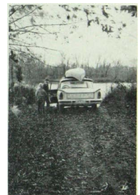
One of the smaller access areas is on the St. Croix River provided by a public power company.