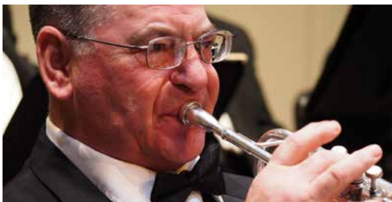
■ ITASCA ORCHESTRA