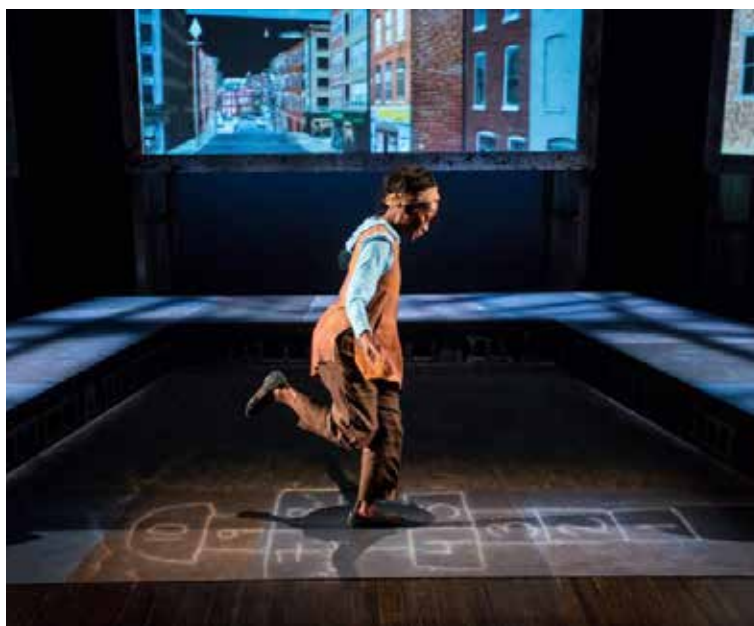
■ SEEDFOLKS, CHILDREN'S THEATER COMPANY