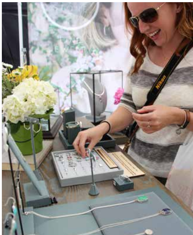
■ GRAND MARAIS ART COLONY

The Arts Board provided support to eleven community arts education organizations or programs that offer lifelong learning in the arts in a variety of disciplines such as: Artaria Quartet's Chamber Music School, West Saint Paul; Eden Prairie Art Center, Eden Prairie; Lake Superior Youth Chorus, Duluth; Universal Music Center, Red Wing; and Young Dance, Minneapolis.