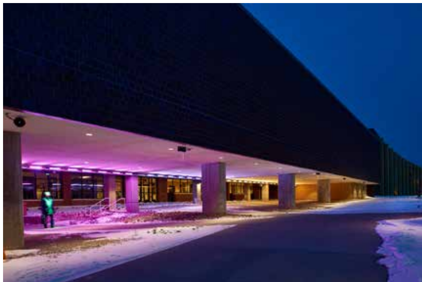
■ CHROMALUME CHIME GARDEN, CENTURY COLLEGE | ARTIST: KEVIN DOBBE

Up to one percent of the total budget appropriated for construction of new or renovated state buildings may be used to purchase or commission works of art. The Percent for Art in Public Places program, established in 1984 by legislative mandate, operates under the auspices of the Minnesota Department of Administration and is managed by the Minnesota State Arts Board.