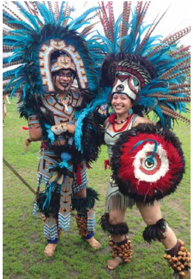
■ KALPULLI KETZALCOATLICUE | MINNEAPOLIS

The State of Minnesota appropriated $37,902,640 to the Minnesota State Arts Board for fiscal year 2017. Of that amount, $7,530,000 came from the state's general fund and $30,372,640 came from the arts and cultural heritage fund. This report contains highlights and stories of how these funds were granted, enhancing the lives of Minnesota residents and contributing to the health and vitality of their communities.