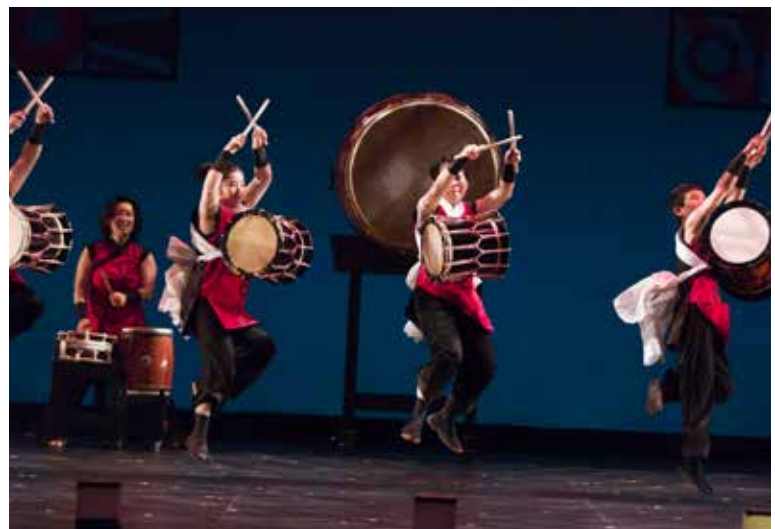
■ TAIKO ARTS MIDWEST

The State of Minnesota has a long history of supporting arts and culture through decades of appropriations from the general fund. In 2008, public resources available expanded greatly when the people of Minnesota passed the Clean Water, Land, and Legacy Amendment. This extraordinary measure wrote into the state constitution a significant, ongoing source of support for arts, arts education, arts access, and preservation of Minnesota’s cultural heritage.