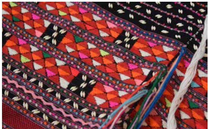
■ FOLK AND TRADITIONAL ARTS EXHIBITION KAREN ORGANIZATION OF MINNESOTA, SAINT PAUL

GOAL STRATEGY The arts thrive in Minnesota Foster visionary, skilled arts leaders and organizations statewide Ensure sufficient resources to sustain the arts and artists Serve as a clearinghouse of information on best practices and successful programs