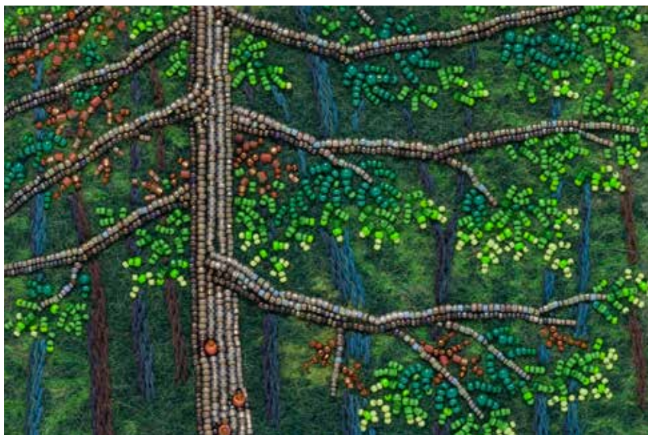
■ JO WOOD, A Sense of Place