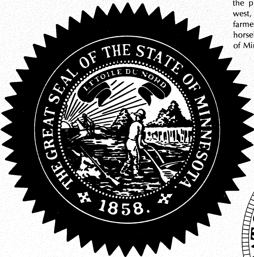
State seal, 1971-1983

This seal was similar to the others, but it made two important changes. It added some Norway pines (the state tree) above the Falls of St. Anthony to serve as symbols of Minnesota's northern forests. And it put the Indian back in the picture. Instead of galloping away to the west, the Indian is trotting south toward the farmer. As the law explains, "The Indian on horseback represents the great Indian heritage of Minnesota."