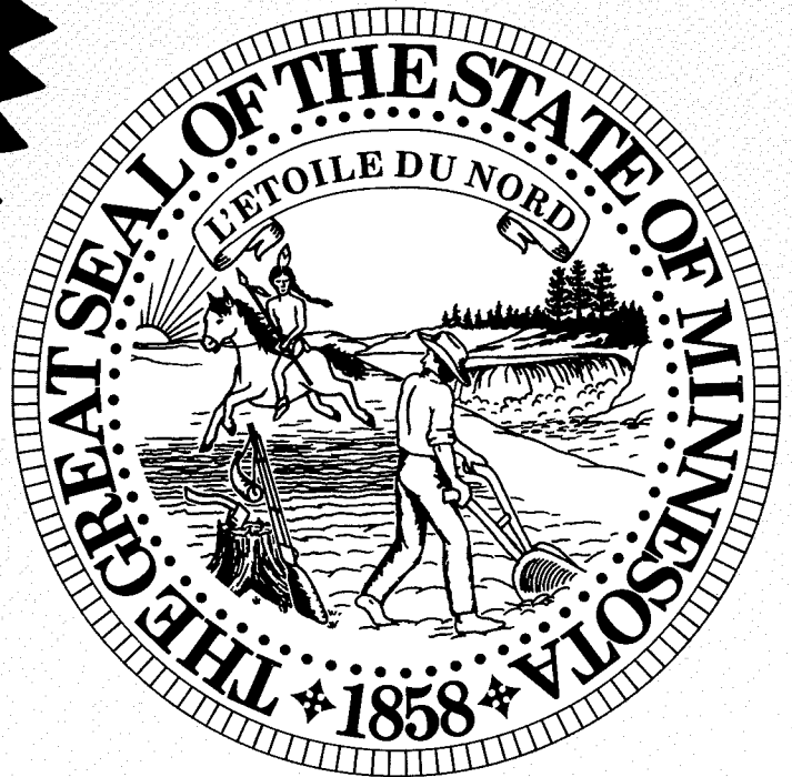
State seal, 1983-

In 1968 the Minnesota Human Rights Commission asked the state government to design a new seal that all Minnesotans could be proud of. The secretary of state approved a new design in 1971. This second state seal removed the Indian completely and replaced him with a white settler riding westward.