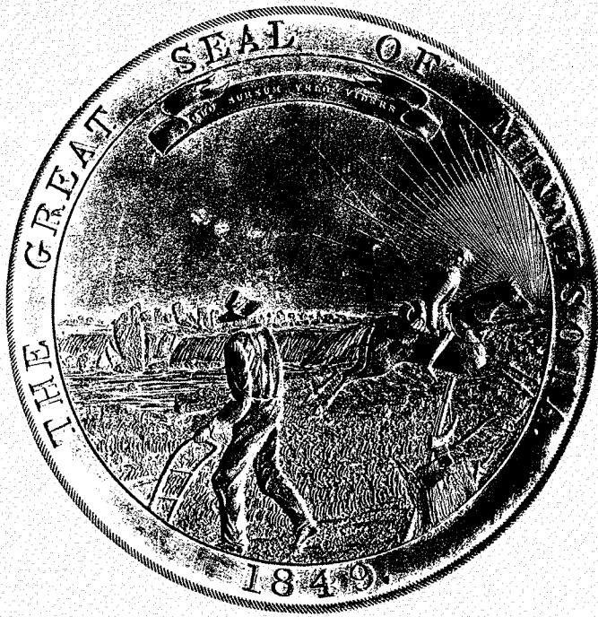
Territorial seal, 1849–1858