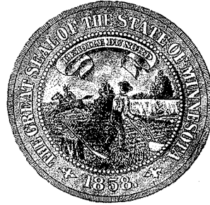
THE present great seal of the state

Though the general design is the same, the original seal and the one now in use differ somewhat in detail. Variations, for example, occur in the scroll bearing the motto, the number and arrangement of the trees, the character of the ground being plowed, the pace of the horse, the position of the Indian's spear, and the placing of the white man's gun. Entirely absent from the present design is an ax, with its blade imbedded in the tree stump, which appears in the original design. Apparently engravers have been careless about including details from the die made in 1858 when new seals were needed.