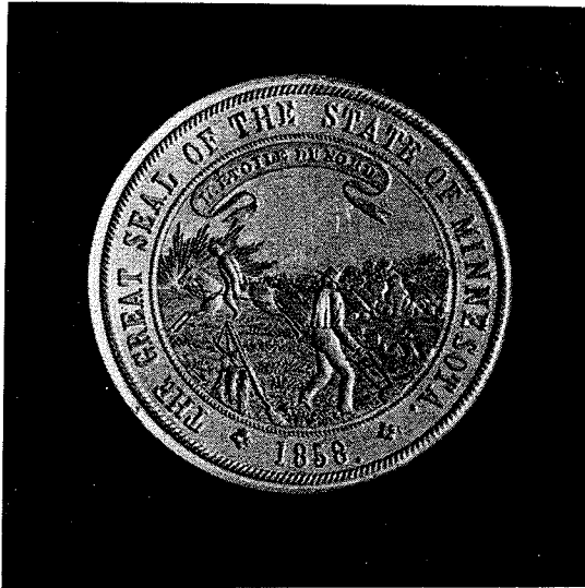
THE original die of the great seal, actual size