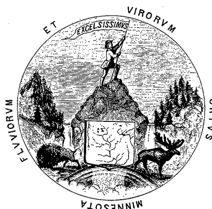
NEILL'S design for a state seal

The story of its subsequent adventures can be traced in a series of letters recently discovered in the state archives and in the